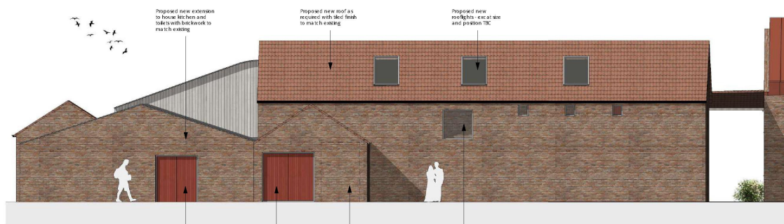
Proposed new timber